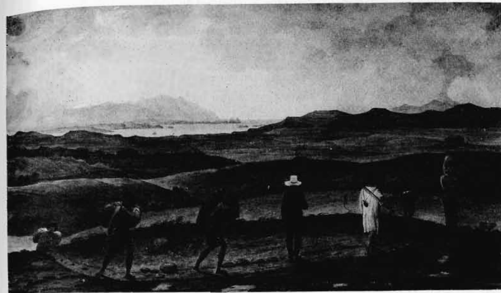
1.2 Augustus Earle, Distant View of the Bay of Islands, New Zealand (ca. 1827). Watercolor, 26 × 44.1 cm.

If Earle were simply following picturesque conventions, the “landscape itself” would have had nothing to say about the matter. And if the “un-