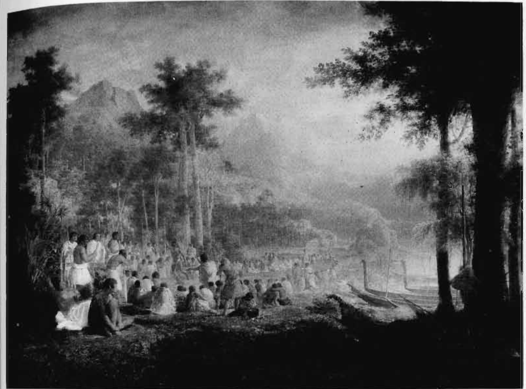
1.1 J. A. Gilfillan, A Native Council of War (1853).

Pound replaces the binary oppositions of a retrospective nationalist myth with the historical categories appropriate to the self-understanding and self-representation of New Zealand landscape. The question is whether this move doesn’t simply reinstate the categories of imperial landscape conventions without questioning their specific historical function.