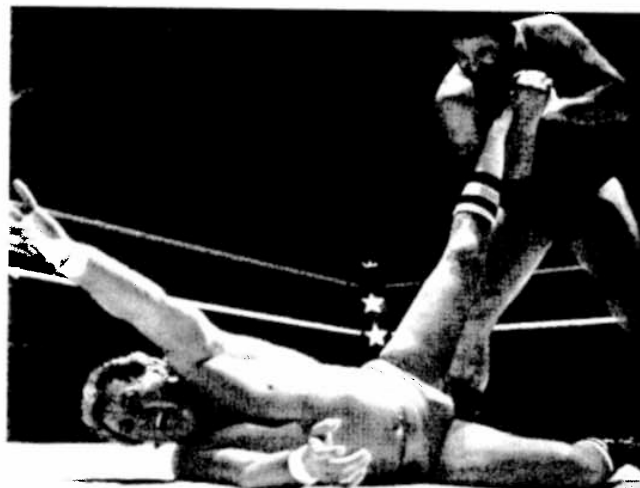
FIGURE 1.4 Wrestling as a language of ‘excess’.

The underlying argument behind the semiotic approach is that, since all cultural objects convey meaning, and all cultural practices depend on meaning, they must make use of signs; and in so far as they do, they must work like language works, and be amenable to an analysis which basically makes use of Saussure’s linguistic concepts (e.g. the signifier/signified and langue/parole distinctions, his idea of underlying codes and structures, and the arbitrary nature of the sign). Thus, when in his collection of essays, Mythologies (1972), the French critic, Roland Barthes, studied ‘The world of wrestling’, ‘Soap powders and detergents’, ‘The face of Greta Garbo’ or ‘The Blue Guides to Europe’, he brought a semiotic approach to bear on ‘reading’ popular culture, treating these activities and objects as signs, as a language through which meaning is communicated. For example, most of us would think of a wrestling match as a competitive game or sport designed for one wrestler to gain victory over an opponent. Barthes, however, asks, not ‘Who won?’ but ‘What is the meaning of this event?’ He treats it as a text to be read . He ‘reads’ the exaggerated gestures of wrestlers as a grandiloquent language of what he calls the pure spectacle of excess.