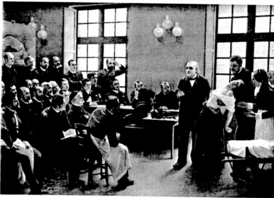
FIGURE 1.8 André Brouillet, A clinical lesson at La Salpêtrière (given by Charcot), 1887.

Brouillet shows a hysterical patient being supported by an assistant and attended by two women. For many years, hysteria had been traditionally identified as a female malady and although Charcot demonstrated conclusively that many hysterical symptoms were to be found in men, and a significant proportion of his patients were diagnosed male hysterics, Elaine Showalter observes that 'for Charcot, too, hysteria remains symbolically, if not medically, a female malady' (1987, p. 148). Charcot was a very humane man who took his patients' suffering seriously and treated them with dignity. He diagnosed hysteria as a genuine ailment rather than a malingerer's excuse (much as has happened, in our time, after many struggles, with other illnesses, like anorexia and ME). This painting represents a regular feature of Charcot's treatment regime, where hysterical female patients displayed before an audience of medical staff and students the symptoms of their malady, ending often with a full hysterical seizure.