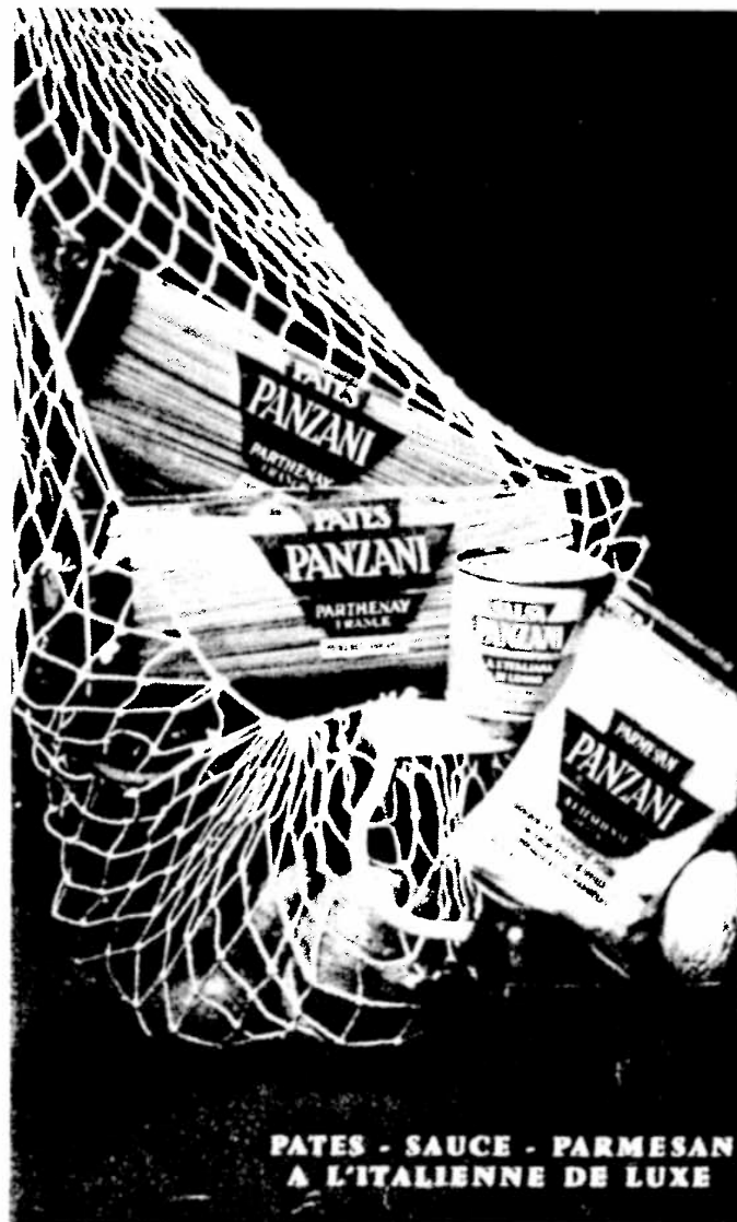
FIGURE 1.6 'Italian-ness' and the Panzani ad.

Now read the second extract from Barthes, in which he offers an interpretation of the Panzani ad for spaghetti and vegetables in a string bag as a 'myth' about Italian national culture. The extract from 'Rhetoric of the image', in Image-Music-Text (1977), is included as Reading D at the end of this chapter.