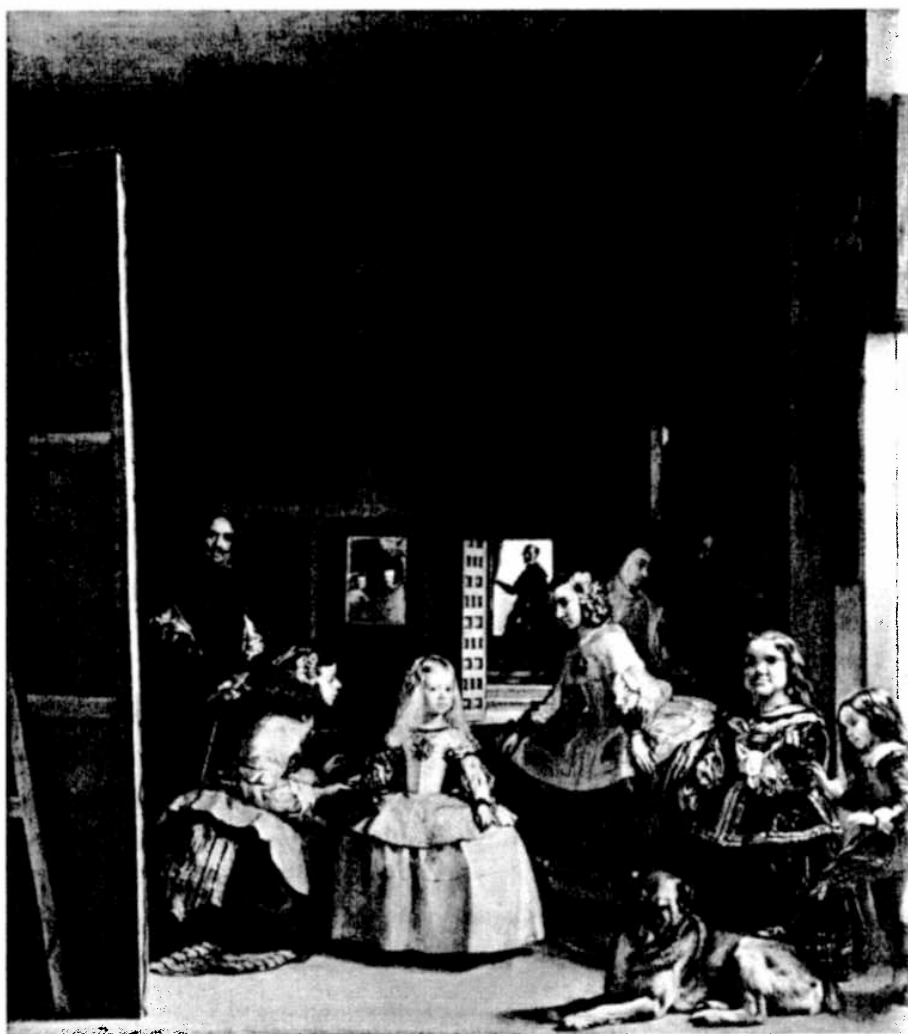
FIGURE 1.9 Diego Velasquez, Las Meninas , 1656.

Look at the picture carefully, while we summarize Foucault's argument.