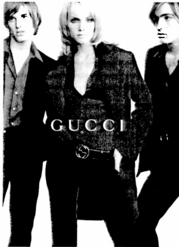
FIGURE 1.5 Advertisement for Gucci, in Vogue , September 1995.

Denotation is the simple, basic, descriptive level, where consensus is wide and most people would agree on the meaning (‘dress’, ‘jeans’). At the second level – connotation – these signifiers which we have been able to ‘decode’ at a simple level by using our conventional conceptual classifications of dress to read their meaning, enter a wider, second kind of code – ‘the language of fashion’ – which connects them to broader themes and meanings, linking them with what, we may call the wider semantic fields of our culture: ideas of ‘elegance’, ‘formality’, ‘casualness’ and ‘romance’. This second, wider meaning is no longer a descriptive level of obvious interpretation. Here we are beginning to interpret the completed signs in terms of the wider realms of