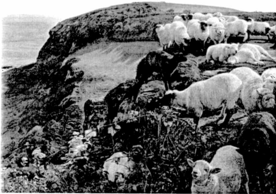
FIGURE 1.1 William Holman Hunt, Our English Coasts ('Strayed Sheep') , 1852.