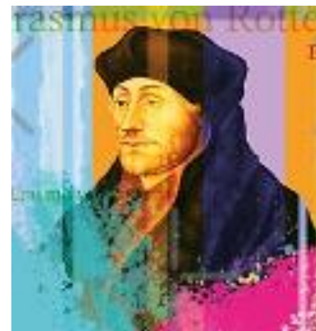
Erasmus of Rotterdam 1466 - 1536

Europe is a multicultural and multilingual entity