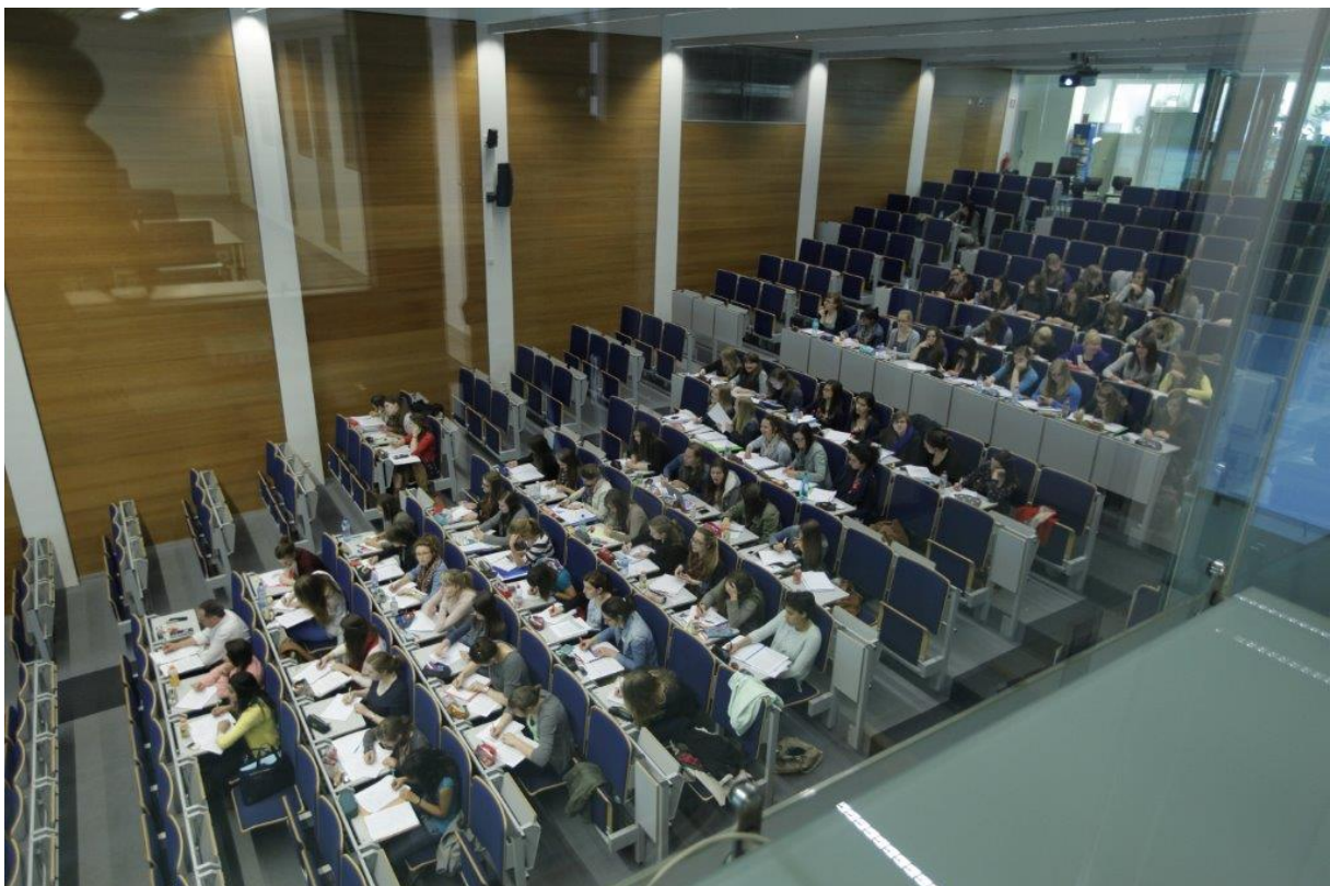
Lecture in “conference hall” at the Faculty of Arts, Antwerp Campus (Sint-Andriesstraat)

Students who want to come for the first term or for an entire year don't generally have trouble finding enough ECTS credits, especially if they study two or more foreign languages (or if they only study English). As such, KU Leuven, Faculty of Arts, Antwerp Campus has some 50 incoming exchange students each year (quite a number considering we are a small campus with about 600 “local” students).