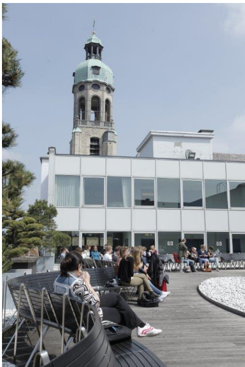
Roof terrace at the Faculty of Arts, Antwerp Campus (Sint-Andriesstraat)

Antwerp is located in the north of Belgium and the Antwerp Campus of the KU Leuven Faculty of Arts offers a Bachelor in Applied Language Studies and Masters in Translation, Interpretation, Multilingual Communication and Journalism (and also Postgraduate Programmes in Specialized Translation, Conference Interpreting and Literary Translation ). As we are a faculty of applied language studies, our main focus is not on literary studies and linguistics as such, but rather on language proficiency and skills. Additional information (in English) on our programmes can also be found in the folder "Focus on KU Leuven Faculty of Arts, Campus Sint-Andries, Antwerp".