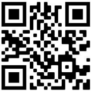
Instruction video on how to provide a DLA